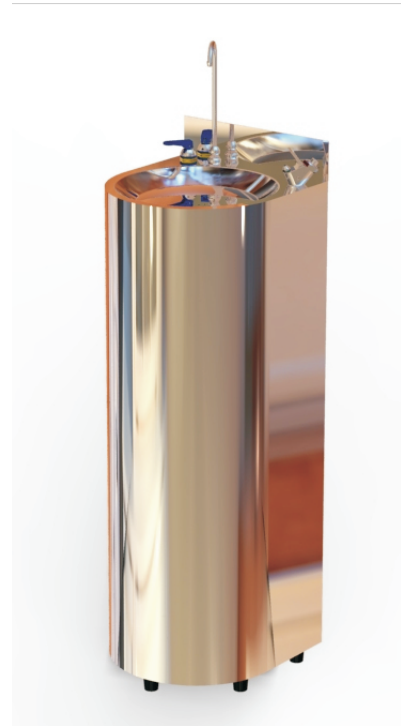
MODEL TL15 SHOWN

Perfect for either public or private settings, our water coolers are a great fit in indoor environments. This series is precisely mounted, making it a nice addition to any surrounding. Beautiful mirror finish basin helps to maintain the fountains overall appeal so it always remains looking as new as it did when it was installed. Specifically, this type fountain may be placed in settings such as: office buildings, shopping malls, and other indoor environments where there is a demand for a chilled water source.