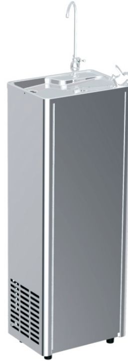
MODEL TL21-500A SHOWN

Perfect for either public or private settings, our water coolers are a great fit in indoor environments. This series is precisely mounted, making it a nice addition to any surrounding. Beautiful satin finish basin helps to maintain the fountains overall appeal so it always remains looking as new as it did when it was installed. Specifically, this type fountain may be placed in settings such as: office buildings, shopping malls, and other indoor environments where there is a demand for a chilled water source.